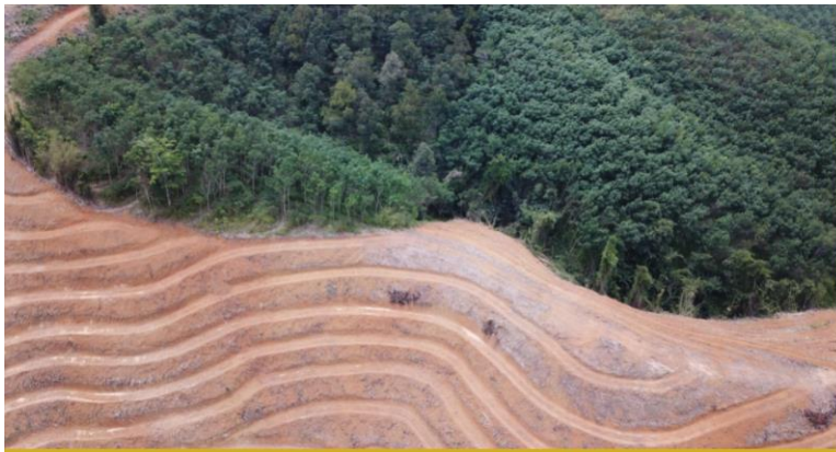
Toward deforestation-free palm oil

We require all our key palm oil suppliers to have an NDPE policy (No Deforestation, No Peat and No Exploitation). This policy is the starting point for a sustainable palm supply chain and describes the measures we need to take as an industry. Since 2021, 100% of our key palm oil suppliers have an NDPE policy.